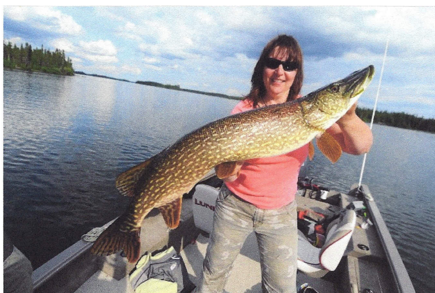
42.5 INCHES! - That's what a trophy-sized Northern Pike looks like.